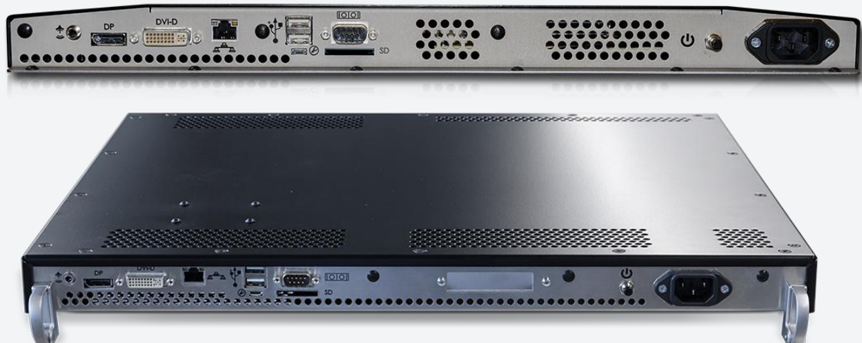
Connectors (internal for Outdoor Displays series)